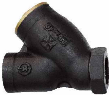
KS B 1538